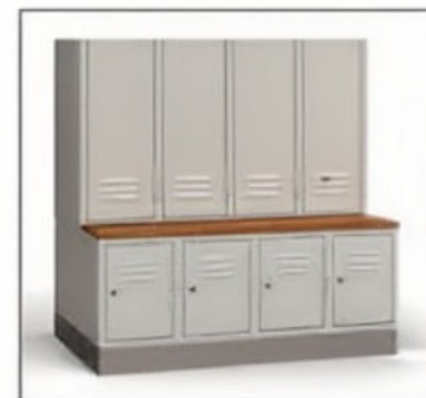
+ STAINLESS-STEEL BASE OPTION