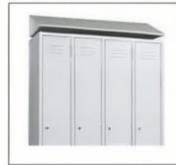
+ SLOPED TOP OPTION