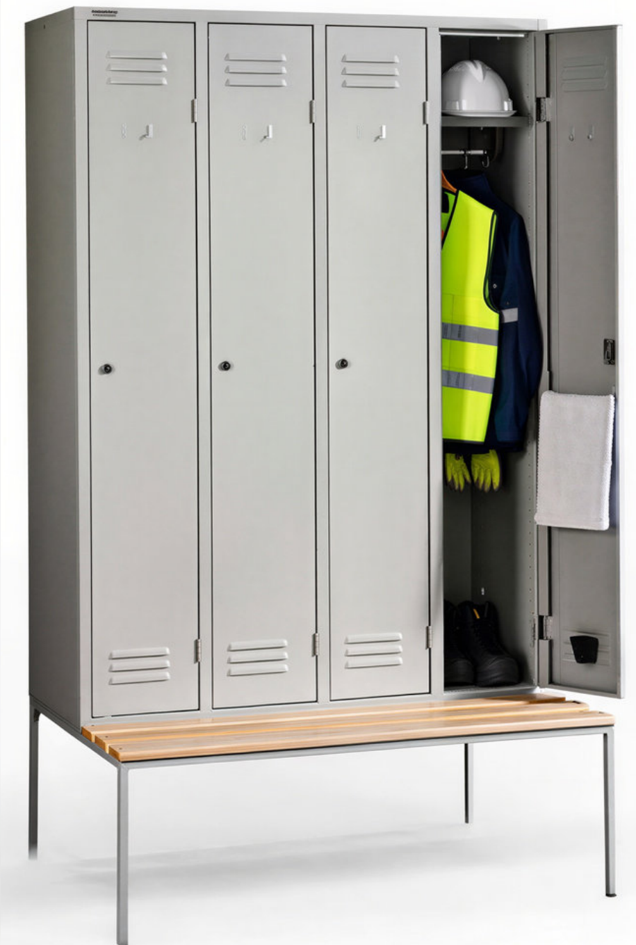
Bench as a functional element for everyday use