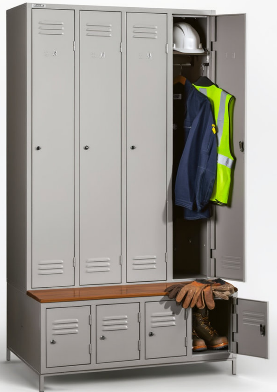
Lower storage units for shoes and personal equipment