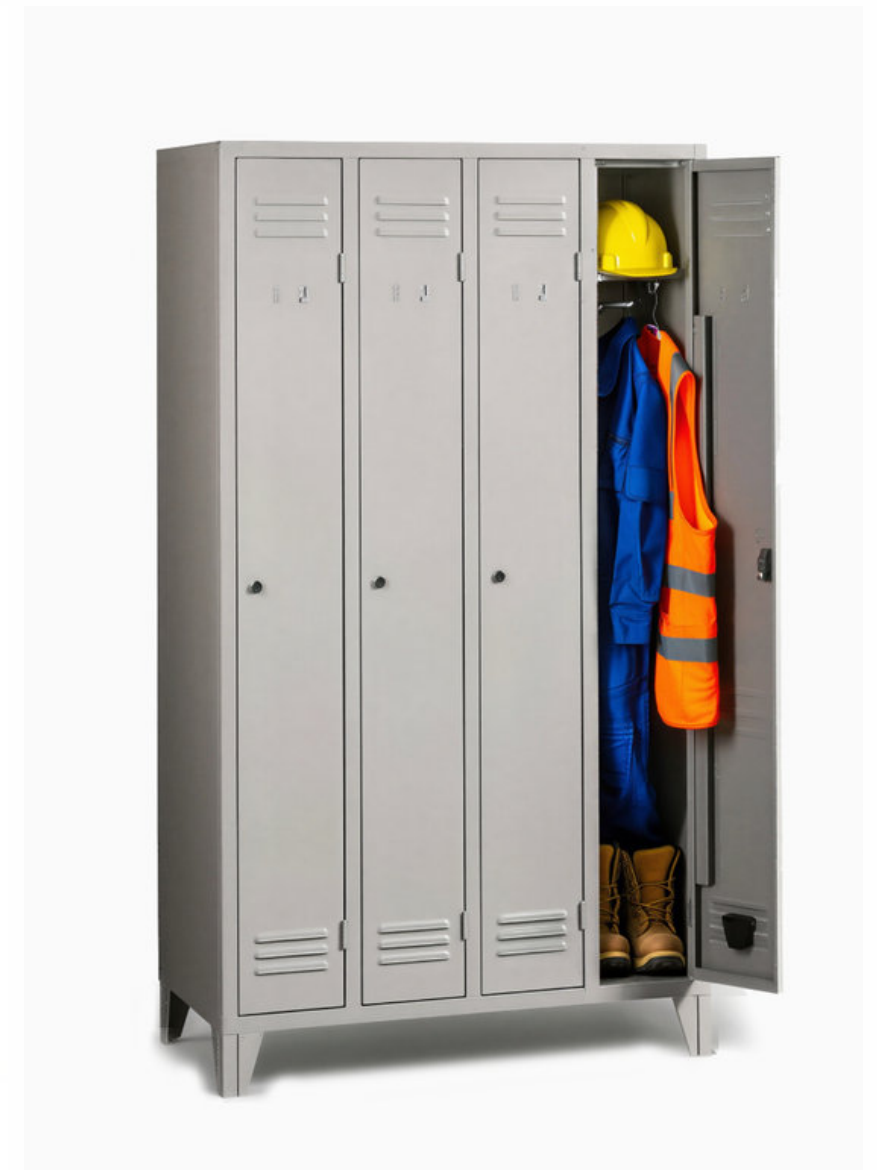
SPACE-SAVING LOCKER CABINET

The divided interior and center opening provide easy access and better visibility. Suitable for intensive daily use.