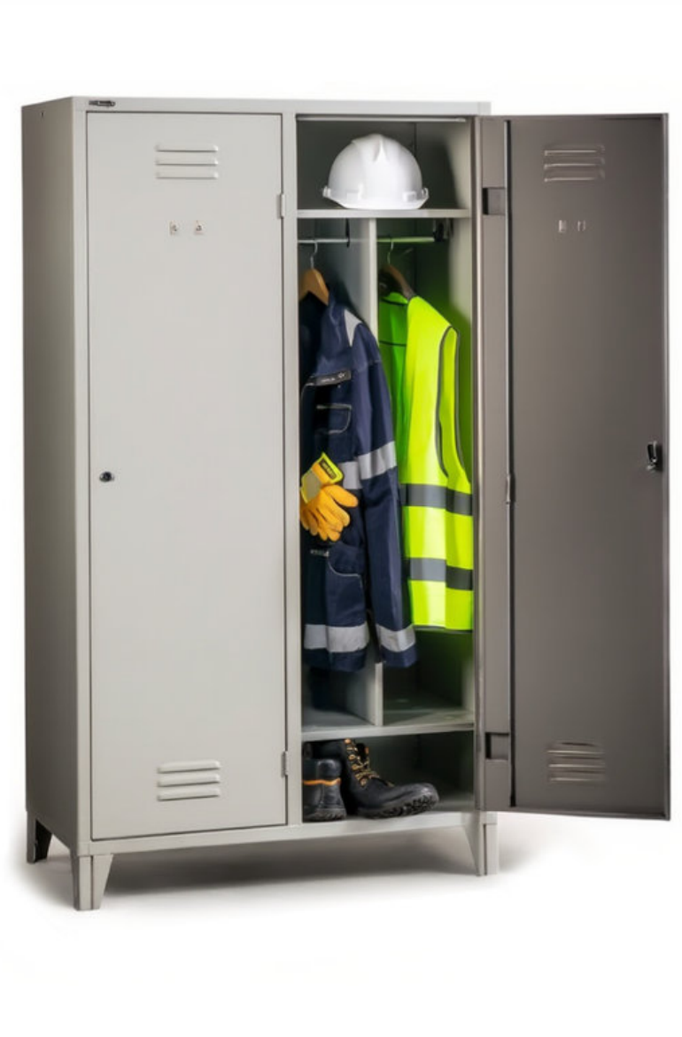
LOCKER CABINET WITH PARTITION WALL AND SHOE SPACE

Provides clear separation between workwear and personal clothing. The interior layout supports better hygiene and day-to-day order.