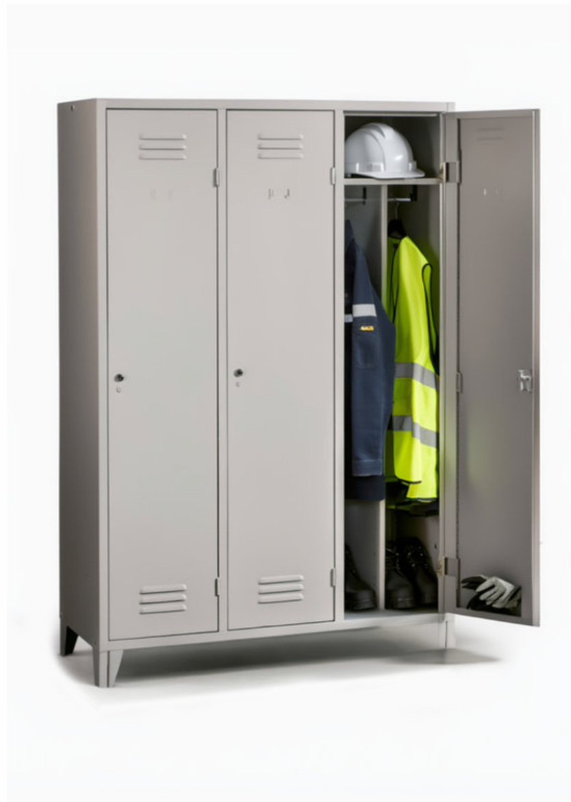
LOCKER CABINET WITH PARTITION WALL

Provides clear separation between workwear and personal clothing. The interior layout supports better hygiene and day-to-day order.