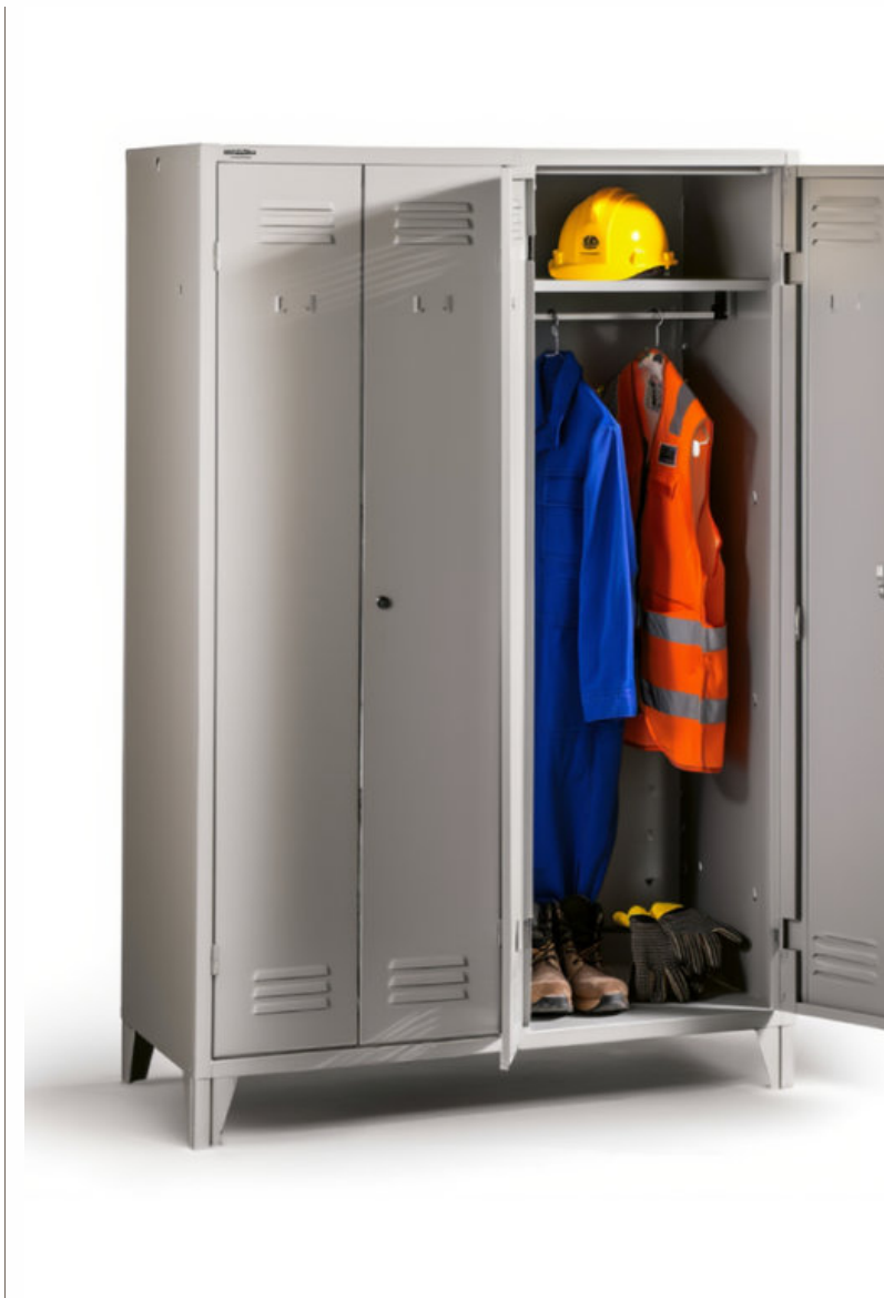
LOCKER CABINET WITH PARTITION WALL AND CENTER-OPENING DOORS

Combines functional separation with extra space for footwear. A practical choice for complete organization of personal equipment.